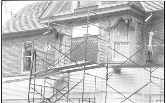
Exterior restoration on the east side of Elmwood.

a spaghetti supper is held on Election Day in November to acknowledge C.A.M. Spencer's election as attorney general in 1890; and for the past seven years a very successful house tour has been held in December.