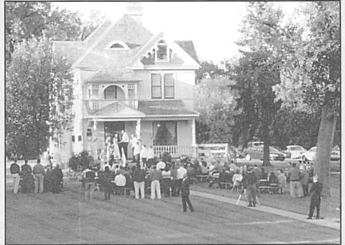
Wedding at Elmwood.

Elmwood sponsors a Mother's Day tea, Spencer's