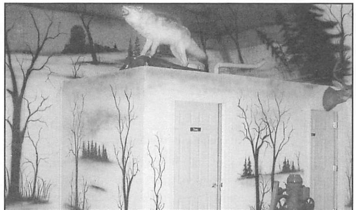
Lone Wolf display at museum.

This past year we have had two fundraisers to help defer the repair costs. Last February we had a calendar draw, and this past fall we had a chili cook-off. These two events brought in approximately $4,300.