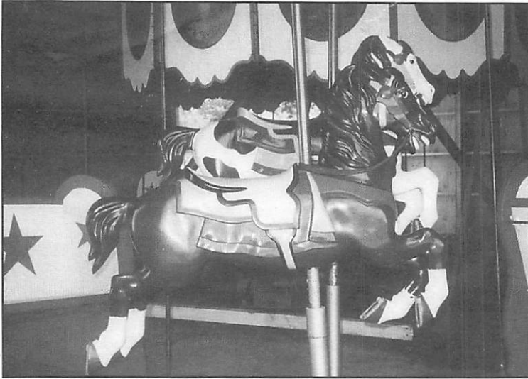
Two beautiful hand-painted horse on the Village Carousel.

The Historical Society received the deed from the State of North Dakota on May 22, 2000 for the west addition at the Heritage Village - 14 plus acres which was former State School property.